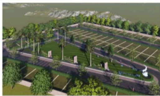
Theme based Gardens