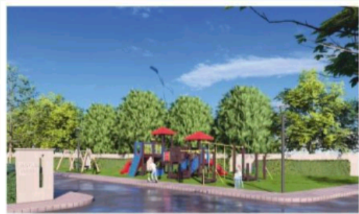
Dedicated Children Play Garden