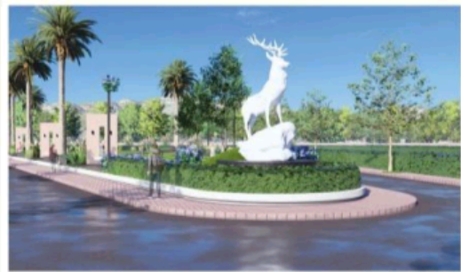
9 Meters Wide Internal Roads